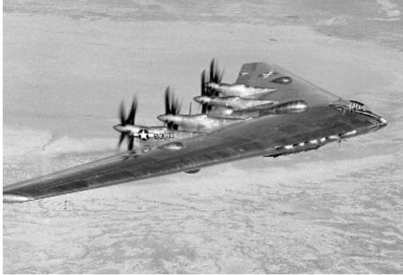
Northrop YB-35 Flying Wing

8206 BEDFORD EULESS RD., NORTH RICHLAND HILLS, TX 76180-7214